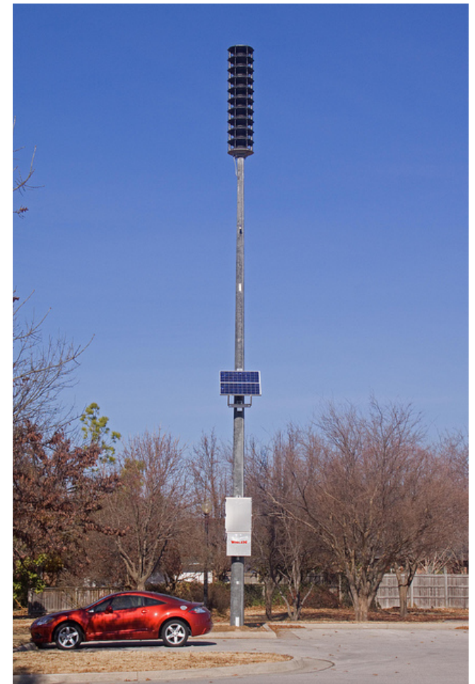
Whelen WPS-2910 Electronic Siren with Solar Power